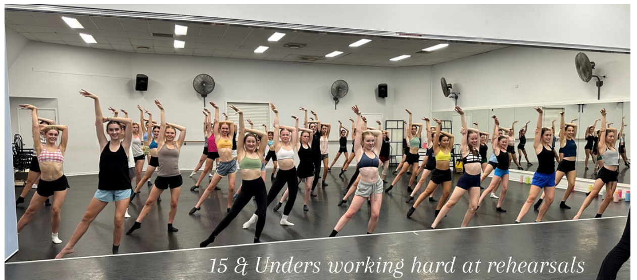
15 & Unders working hard at rehearsals

Our Eisteddfod teams are now organised and rehearsals have begun. Its time for the hard work to begin. We have had to change two of the Eisteddfods that we will be attending this year. Please make sure all the following dates are in your calendars. Unfortunately, dates can change depending on number. The most important part of being in the Eisteddfod team is the commitment to rehearsals each week and ready to work hard. You are part of a team so need to do your very best to never miss rehearsals if at all possible.